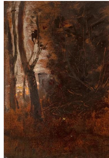
Left: Jean-Baptiste-Camille Corot , French, 1796-1875, À Fontainebleau , c. 1823-24, Oil on board 8 5/8 x 13 inches. Right: Jean-Baptiste-Camille Corot , French, 1796-1875, Effet du soir (Ebauche) , Oil on panel 8 3/8 x 5 5/8 inches.

Two paintings by J. B. C. Corot , done fifty years apart, show us that the artist was always comfortable working on a small scale and that he remained so throughout his career. The 1824 oil sketch, À Fontainebleau is painted outdoors and from an angle which suggests that the artist was standing at the