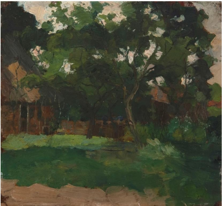
Piet Mondrian , Dutch, 1872-1944, Farm Buildings in Het Gooi, Veiled by Trees , c. 1898-1902, Oil on paper, on board, 12 1/2 x 15 1/8 inches.

Piet Mondrian 's early paintings are predominantly landscapes, scenes of his native Holland with its trees, rivers and canals. And while the subject matter of his art would eventually change dramatically to geometric abstraction, he never worked in a very large format. Our beautiful early landscape is painted on paper and shows Mondrian's early attraction to the flat, grid-like forms and patterns that would become his specialty.