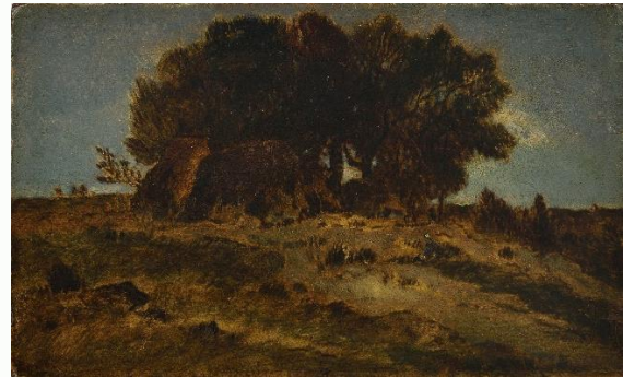
Left: Stanislas Lepine , French, 1835-1892, Panoramic View of Rouen , c. 1876-1880, Oil on cradled panel, 9 1/2 x 13 1/4 inches. Right: Théodore Rousseau, French, 1812-1867, Bouquet d'arbres , Oil on paper laid down on canvas, 5 1/4 x 9 inches.

Stanislas Lepine ’s View of Rouen shows us a scene of rolling hills with a view of the town and its famous cathedral tower in the distance. In spite of its small format, the view seems expansive. A self-trained artist and a quiet and modest man, Lepine made his debut at the Paris Salon in 1859, and then apprenticed to Corot, identifying himself as a student of the older master.