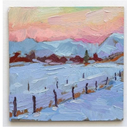
Left: Rachel Rickert , American, b. 1990, Distant Rain, Wyoming , 2022, Oil on panel, 4 x 4 inches. Right: Rachel Rickert , American, b. 1990, Winter Twilight , 2022, Oil on panel, 4 x 4 inches.