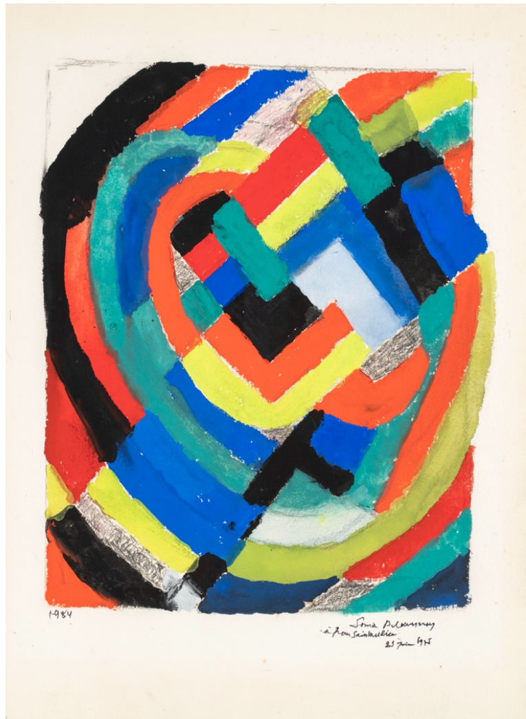
Rhythm in Color (Rythme couleur) , 1975, Paris, Gouache and charcoal on paper, 20 1/4 x 15 1/2 inches, Signed, dated, and dedicated lower right, annotated lower left

Delaunay's work in fashion, both her own clothing designs and her collaborations with known fashion designers, places her then and now at the intersection of fine and decorative arts. Her success in environments that did not traditionally value women's artistic achievements was groundbreaking. As a highly visible and respected figure in Parisian art circles, she defied the gender norms of her time and created a model for future generations of female artists.