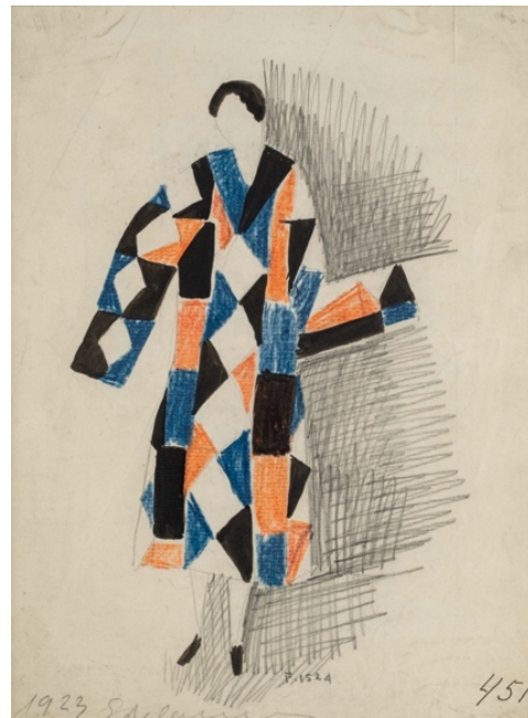
Right: Costume Study (Costume simultané) , 1917, Portugal, Wax and colored pencils on paper, 15 7/8 x 10 inches, Signed and annotated lower right Left: Dress Design (Projet de robe) , 1923, Paris, Ink and colored pencils on paper, 10 5/8 x 8 1/4 inches, Signed and dated lower left, numbered lower