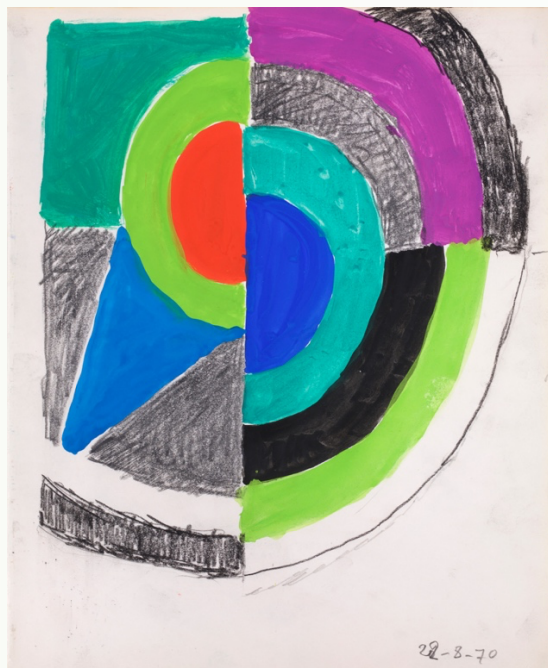
Rhythm in Color (Rythme couleur) , 1970, Paris, Gouache, ink and pencil on paper, 11 1/4 x 9 inches, Dated lower right

Fully illustrated digital catalogue with essay by Isabelle Dervaux available here .