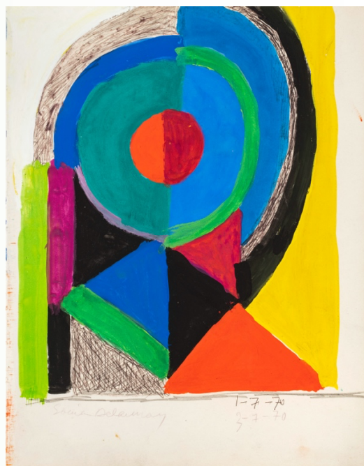
Rhythm in Color (Rythme couleur) , 1970, Paris, Gouache, felt pen and pencil on paper, 11 1/4 x 9 inches, Signed lower left, dated lower right