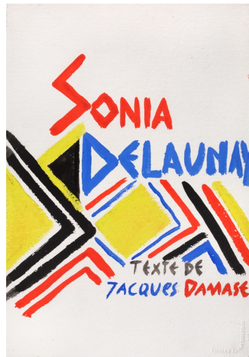
Design for cover of the book "Robes Poèmes" by Jaques Damase (Projet de couverture pour le livre de Jaques Damase, "Robes Poèmes," imprimeurs Jacomet et Hofer), 1969, Paris, Gouache on paper, 12 1/8 x 8 3/8 inches, Numbered on reverse